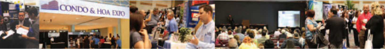
Exhibit Space Rates

$1595* / 10x10' booth *Add $100 per corner booth